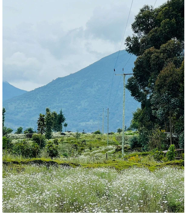
Virunga National Park in Rwanda