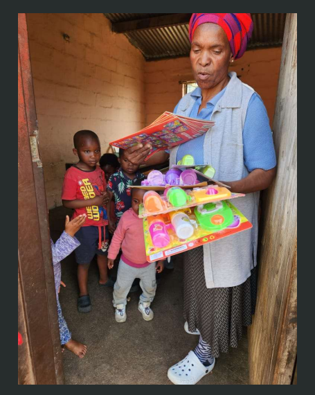
Siyazama Creche received the same, toys and educational material which were greatly appreciated.

Winterton Creche in Harding, received toys and educational material. The kids were so excited, it was like Christmas had come early this year.