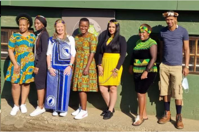
Some thorns among the roses