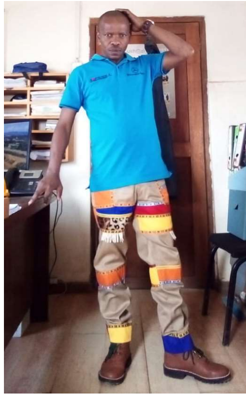
Harding Weighbridge team, not missing out on the fun