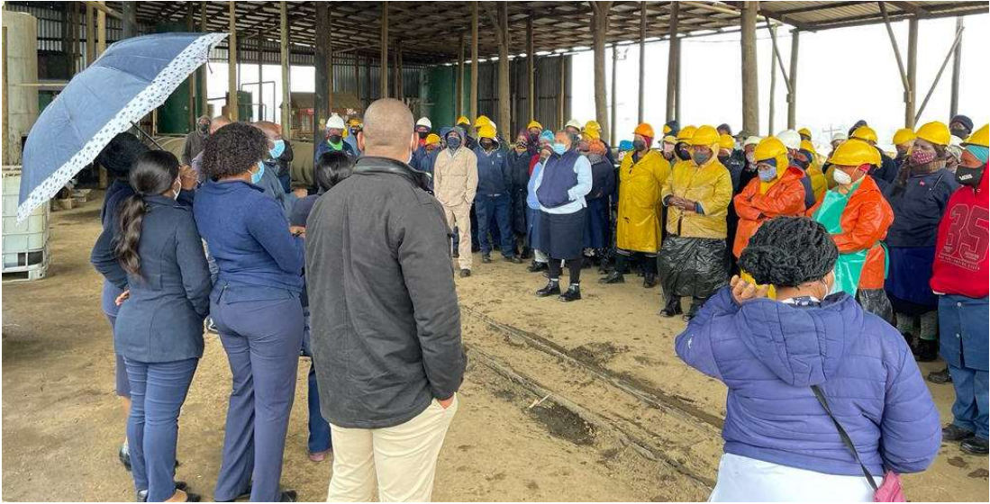
Dept of Health officials address staff & introduced themselves