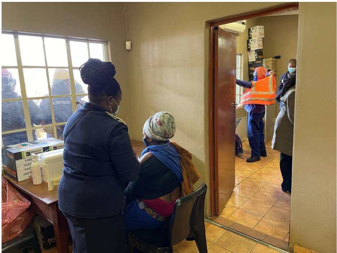
Vaccinate! It's worth a shot 😊