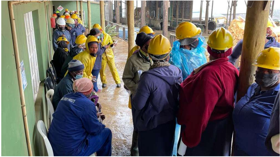
Staff line up, ready to take the jab