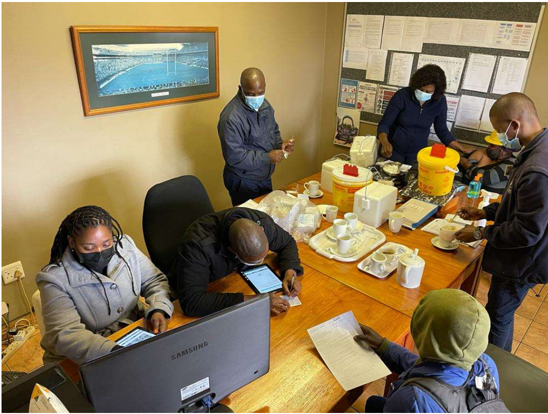
Busy day, no time for tea!