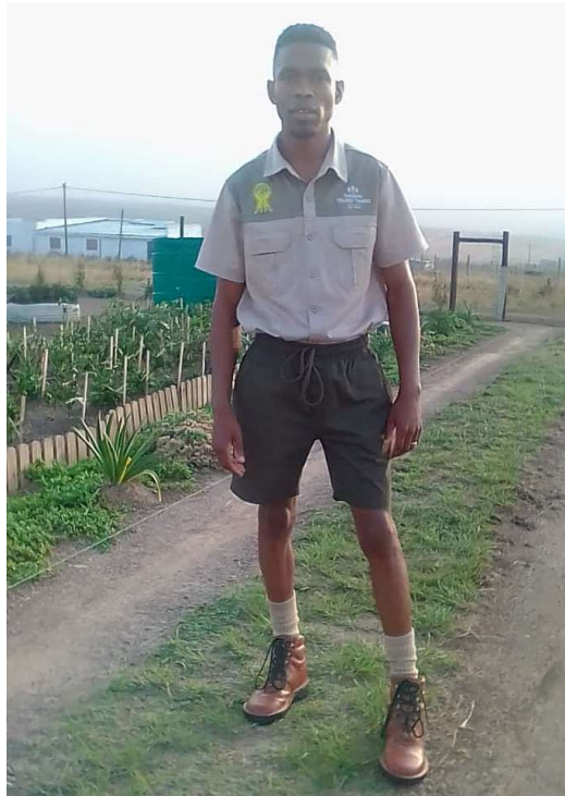
Our resident Green Thumb, representing the farmers!

“It’s really beautiful. It feels like God visits everywhere else but lives in Africa.” - Will Smith